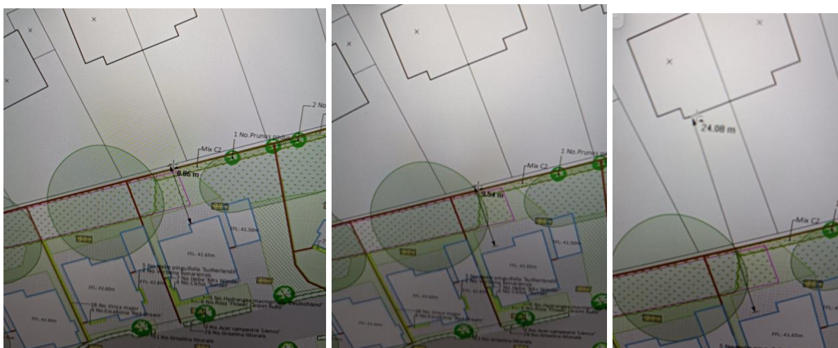
Fig. 15 – Relationship with 29 West Road

The shortest distances between plot 13 and 29 West Road equate to 8.86m from the rear elevation to the shared boundary but this extends to 9.54m between the terrace and the shared boundary and 24.08m between habitable room windows (see Fig. 15 below).