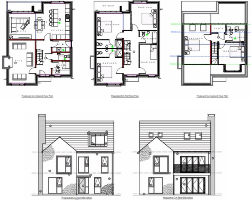
Fig. 5 – Proposed Housetype A1 (plot 13)