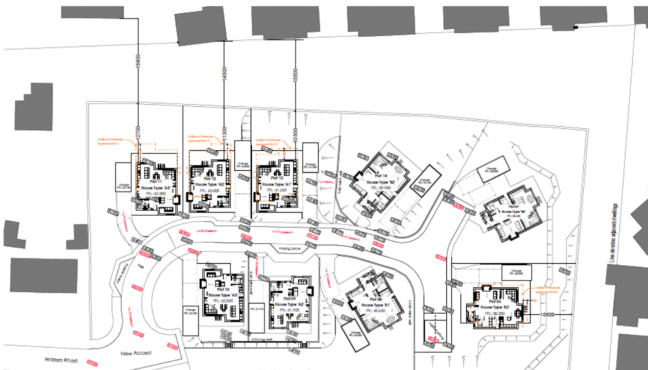
Fig. 1: Revised Site Layout Plan

Since the last Committee meeting, the amended plans have been submitted which have the effect of re-siting plots 12 and 13 further away for neighbouring properties at West Road and re-siting plot 6 further away from neighbouring properties at Coed Parc Court. Plot 11 had already been moved closer to the cul-de-sac.