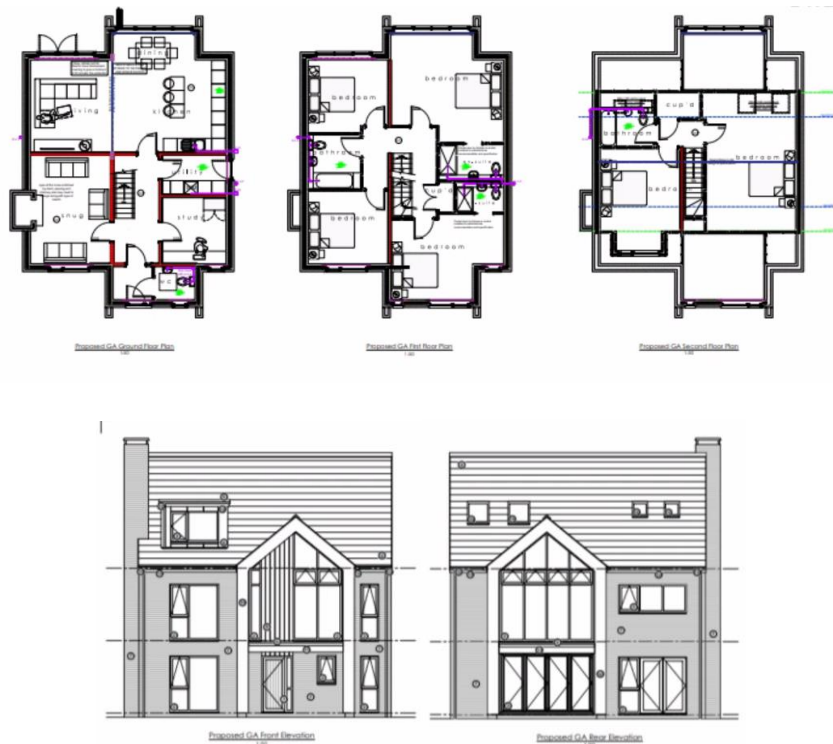
Fig. 11 – Proposed Housetype B3 (plot 6)