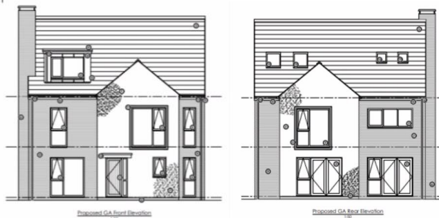
Fig. 10 – Proposed Housetype B2 (plot 14)