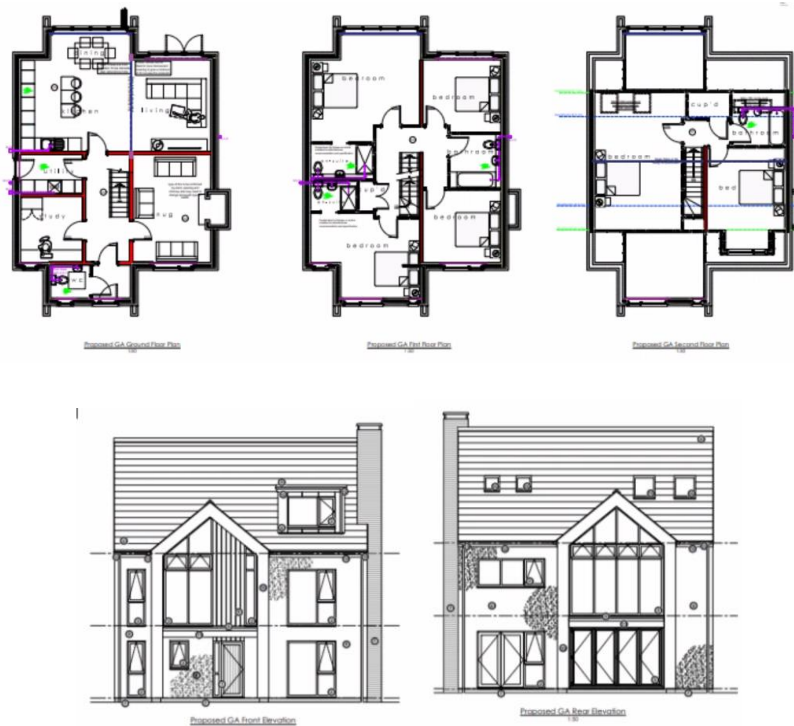
Fig. 12 – Proposed Housetype B4 (plot 7)

As well as there being more of a variety of finishes and designs, the “A” housetypes will incorporate first floor terrace areas accessed from the master bedroom. All housetypes will also incorporate two bedrooms in the roofspace (one with en-suite bathroom) with rooflights to the rear roof slopes and a flat roofed dormer addition to the front elevation overlooking the internal cul-de-sac.