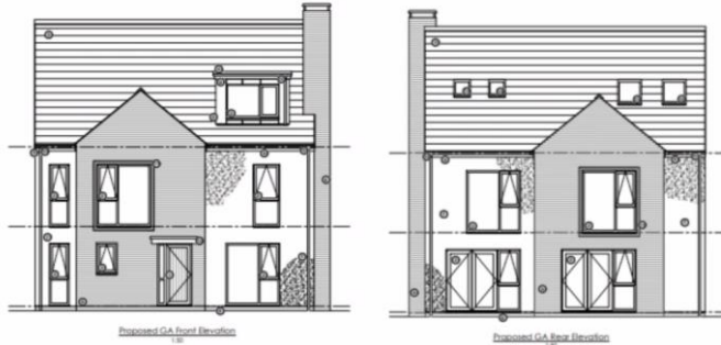
Fig. 9 – Proposed Housetype B1 (plot 8)