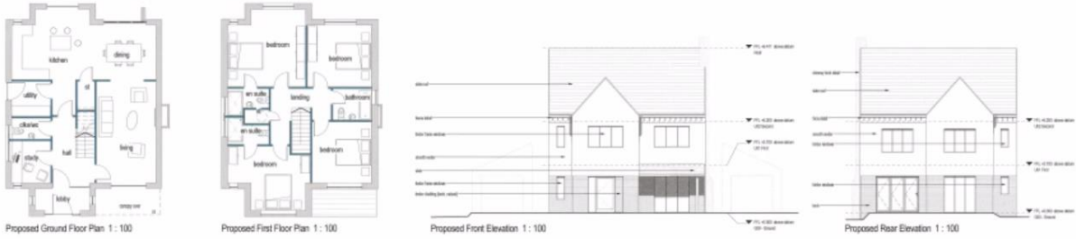
Fig. 4 – Housetype B allowed at appeal