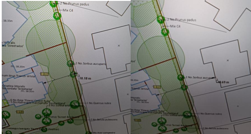
Fig. 16 – Relationship with Coed Parc Court

Turning to the potential impact of the development on properties in Court Parc Court to the east of the site (and properties at Coed Parc to the south of the site), it can be seen that there are no terrace elements to the rear of plot 6 and the rear 1 st floor bedroom windows are separated from the adjoining properties by dense vegetation which will be retained as part of the development. The application site is also at an elevated level with bedroom windows overlooking the roofscapes beyond. There is still a distance of 10.18m between the rear elevation of plot 6 and the shared boundary and 18.69m between habitable room windows although they will not be directly in line.