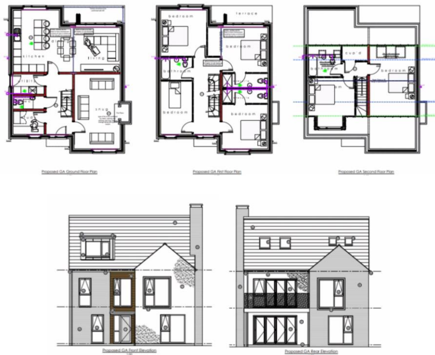
Fig. 7 – Proposed Housetype A3 (plots 10 and 11)